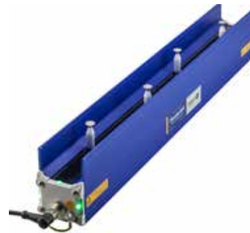
ThunderION 2.0 UL without support -and end brackets for easy cleaning