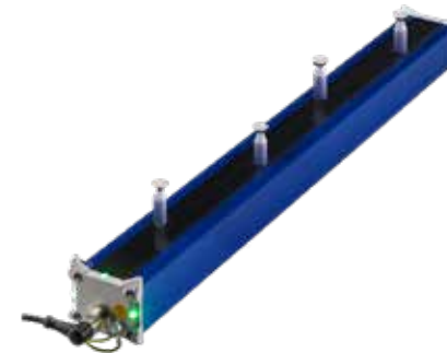
ThunderION 2.0 UL without support brackets, end brackets and sideplates for easy cleaning