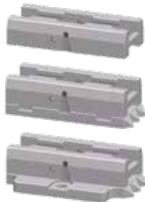
Universal mounting brackets